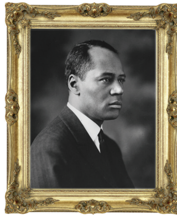
CHARLES H. HOUSTON

Houston died at the age of 54 before racial segregation was ended. However, Marshall picked up the torch and carried it forward, orchestrating his crowning achievement, Brown v. Board of Education . Later, Marshall became the first African-American appointed to the Supreme Court of the United States. Marshall acknowledged the work of his mentor that allowed him his subsequent successes stating “we wouldn’t have been any place” if “Charlie [Houston] hadn’t laid the groundwork for it.”