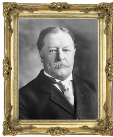
WILLIAM H. TAFT

Photo Credit: c1902, M.P. Price, Washington, DC